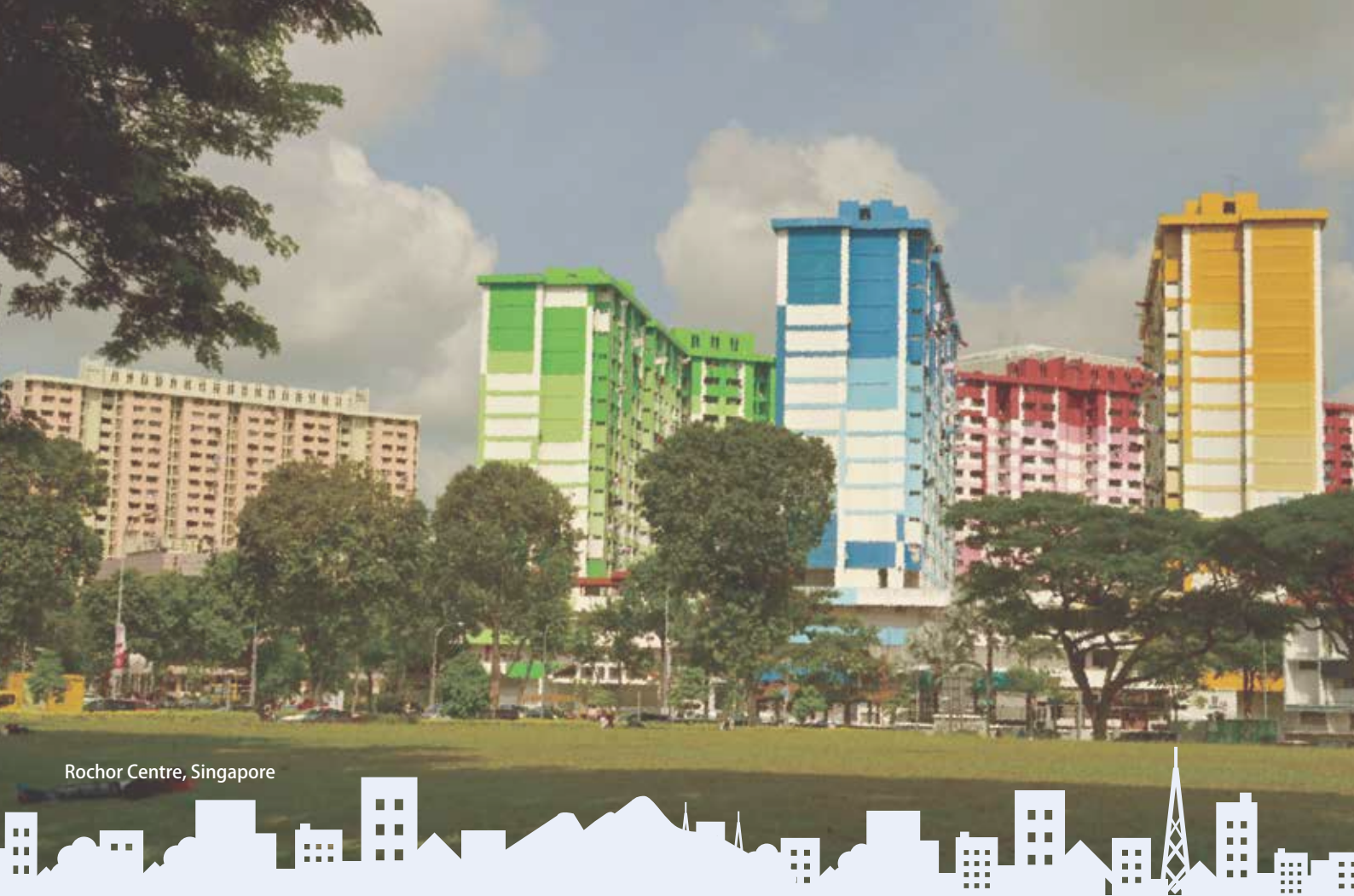
Rochor Centre, Singapore