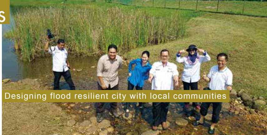
Designing flood resilient city with local communities

A landscape architecture social enterprise working to increase urban resilience in Southeast Asia cities. She has worked on notable projects including a major urban ecological park at the heart of Bangkok. Her actions also include the productive public green space for climate vulnerable communities along the floodplain and coastal area.