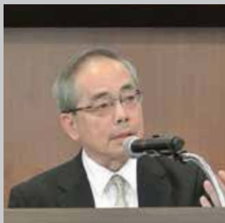
Selection Committee Chair

Professor, Faculty of International Social Sciences, Gakushuin University