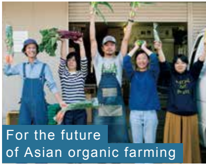
For the future of Asian organic farming