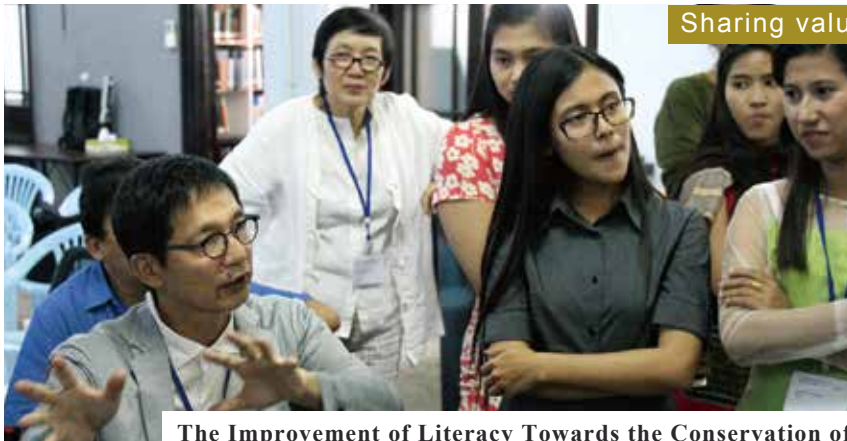
Sharing values of modern architecture with citizen and youth

munity. We will create a social media platform to engage a wider audience as well as the design guidelines and recommendations for implementation in Bangkok, Penang, Jakarta, and other cities with similar climate issues. This raise public awareness of climate challenges and solutions across Southeast Asia.