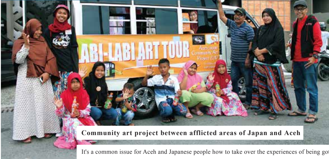
Community art project between afflicted areas of Japan and Aceh

Sharing memories of the disasters through arts